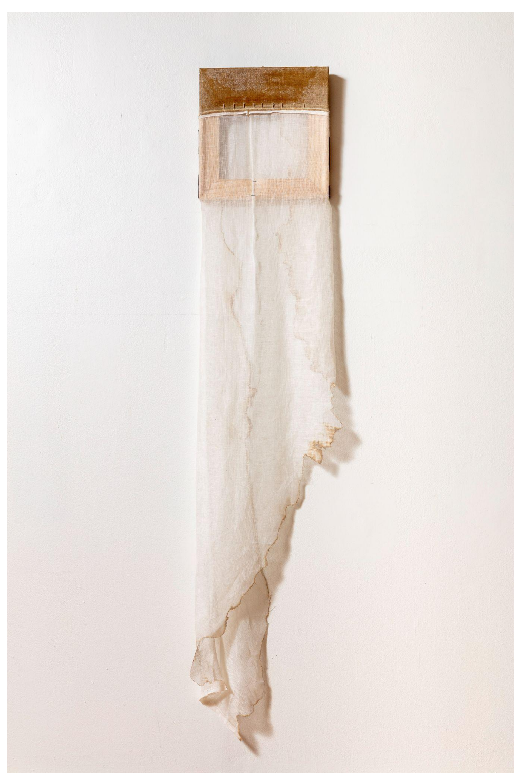
LIMINAL-001 * Rabbit skin glue, hemp twine, scorched leather and staples on linen and gauze $1,800 Sold