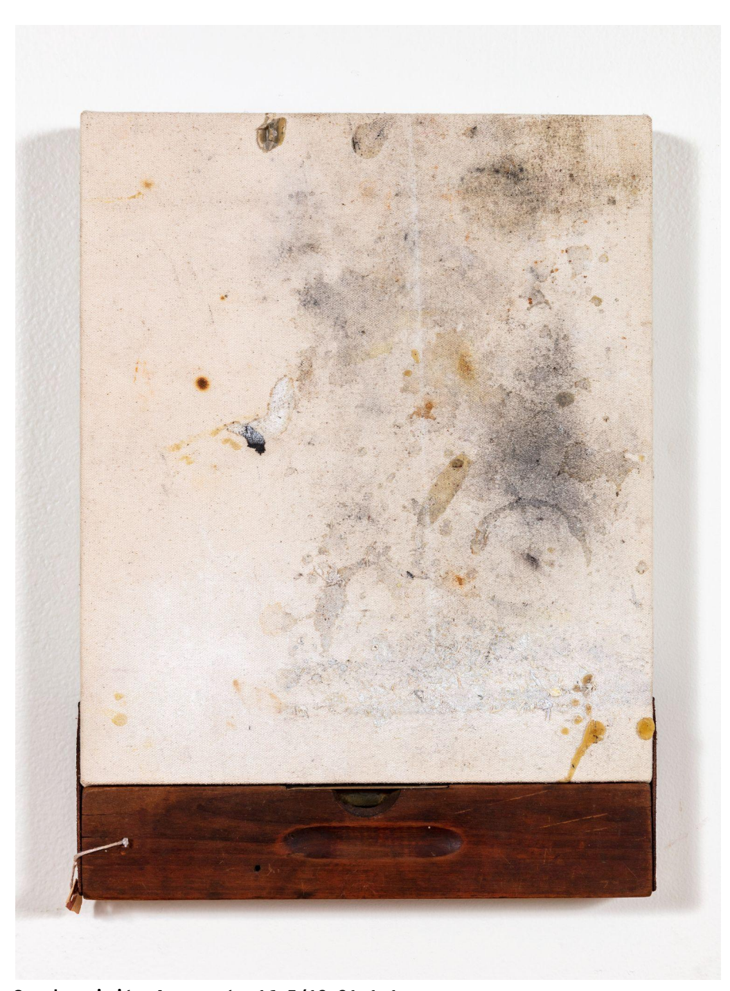
Synchronicity Aggregate 16.5/12_21_1.1

Traces of labor in dust, paper pulp, pigment, fish glue, ash and marble dust on stretched canvas - mounted with leather and nails to level.