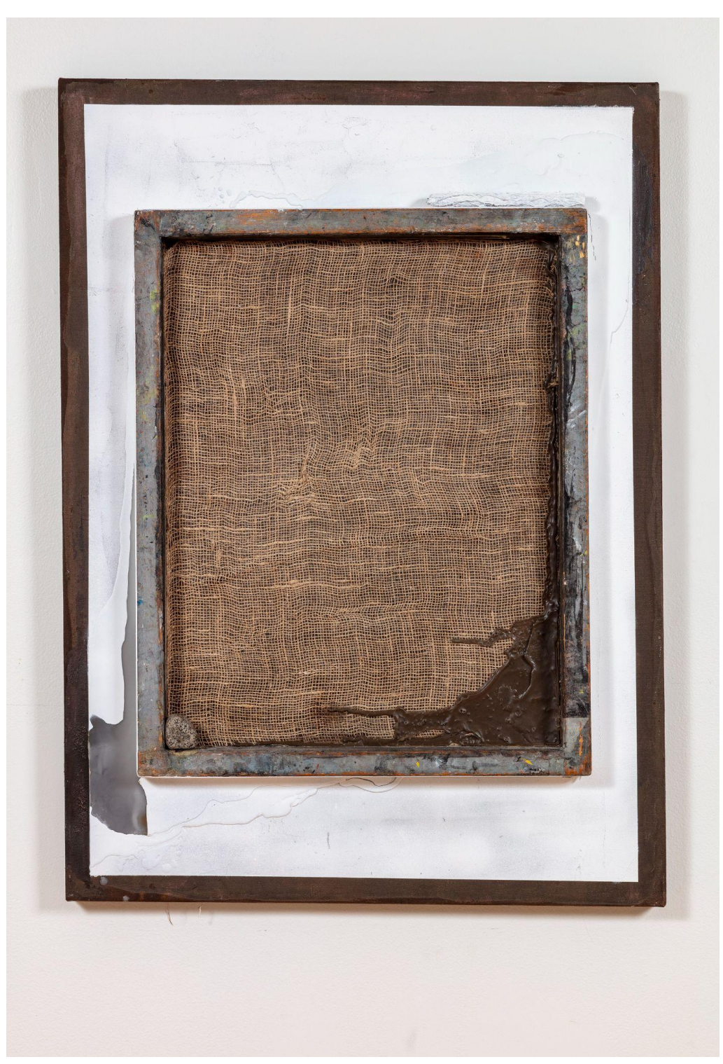
Volume/Void Pigment dye, rabbit skin glue, beeswax, ash, burlap, gesso, stone and branch on stretched canvas $3,500