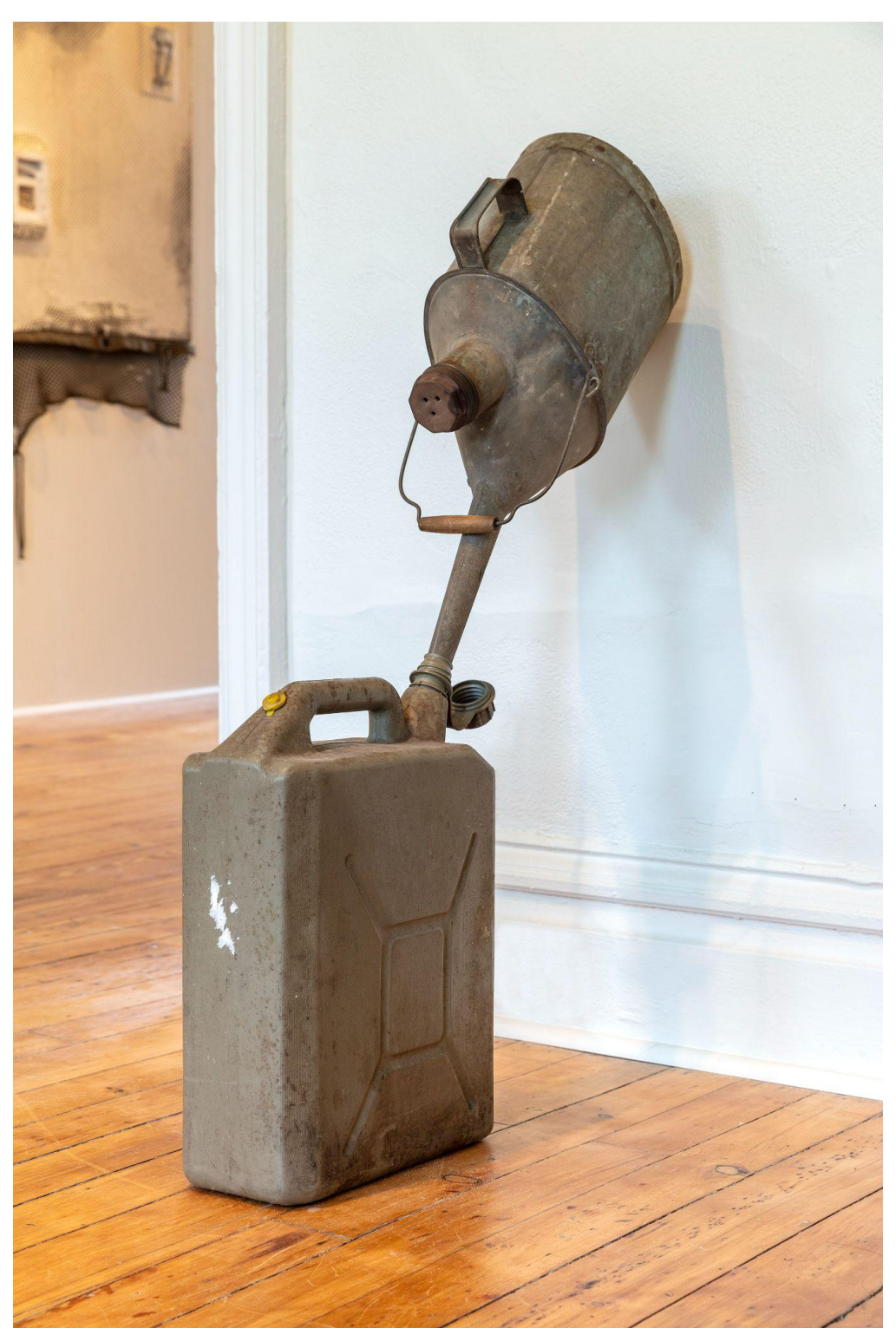
Feedback Loop 30/40_21_1.1 Oil can, gas can, sand 39 x 29 x 10" $1,200