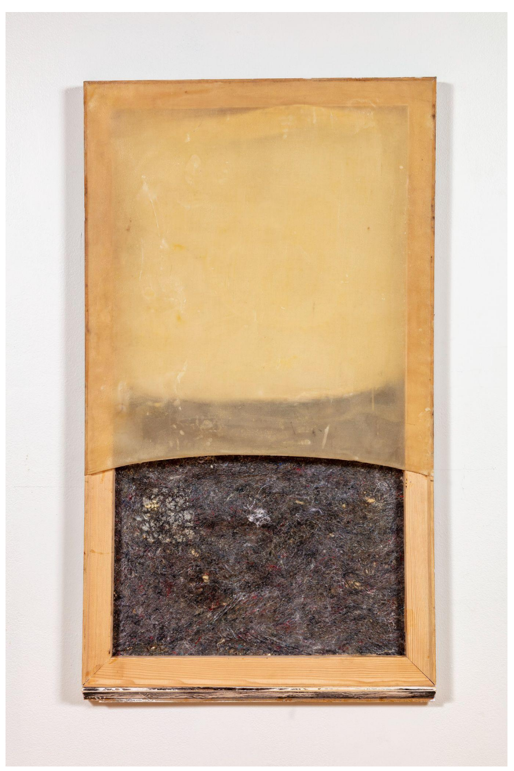
Gesamt Geist (Total Spirit) 49/28_21_1.1

Wool moving blanket, canvas and rabbit skin glue, frame fragment, gesso, beeswax and damar resin on silk, wooden stretcher bars.