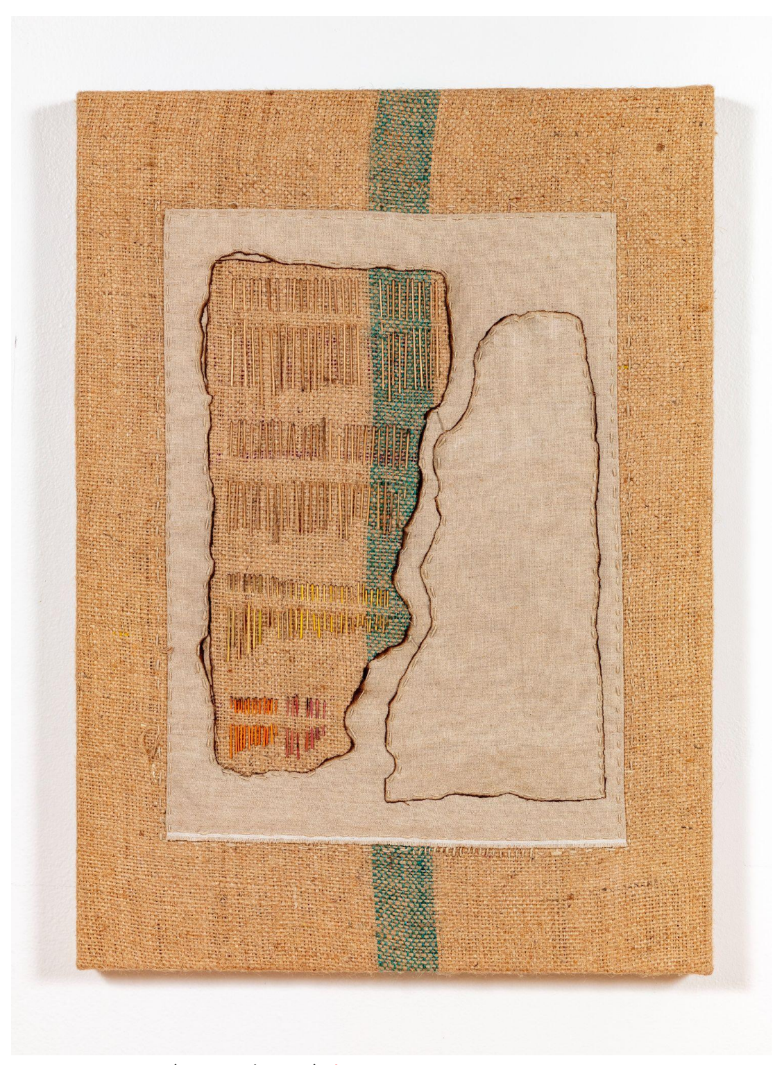
SYNCOPATION-001 (1,836 minutes) * 117 Incense, linen, hemp twine, and combustion on burlap. $2,800 Sold