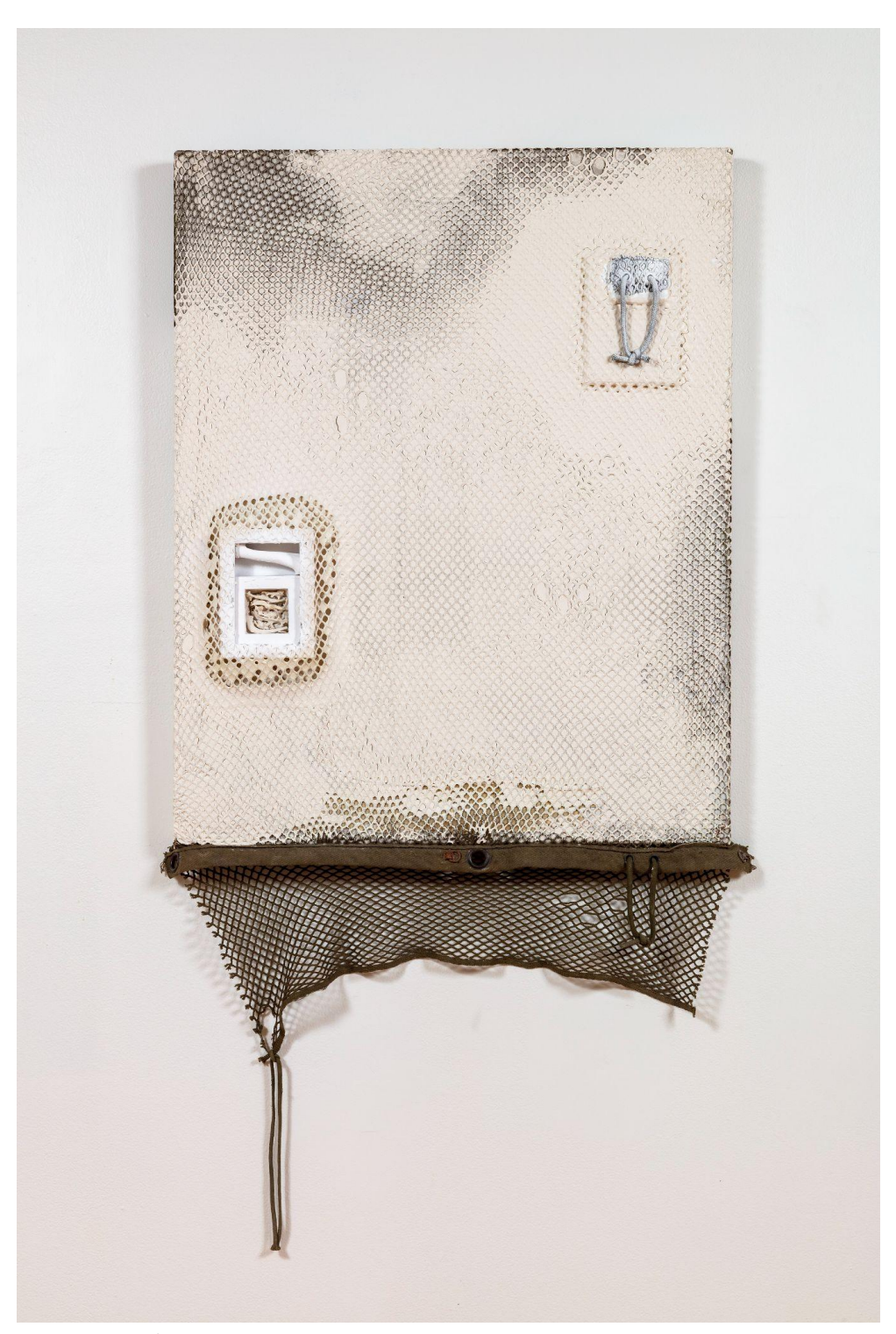
Marrow & Veil 63/31.5_21_1.1

Bone and fragments, rabbit skin glue, latex paint, marble dust, wood, and military netting on stretched duck canvas.