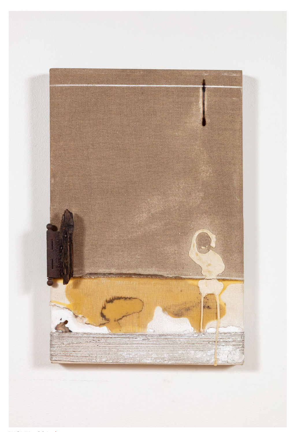
EUCLID-001 * Marble dust, fish glue, beeswax, book binding cloth, hemp twine, found object and combustion on linen and canvas 25.5 \times 17 "